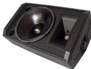
STX 815M Passive Loudspeaker