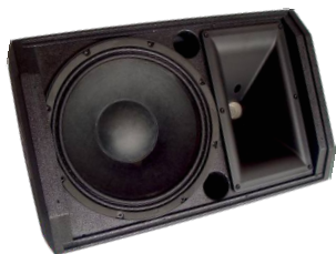
STX 812M Passive Loudspeaker